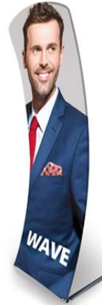
Tension Banners (up to 3m wide)