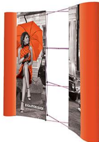
Traditional Straight and Curved Pop ups