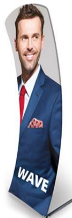
Tension Banners (up to 3m wide)