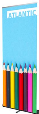
Roller Banners (varying widths)