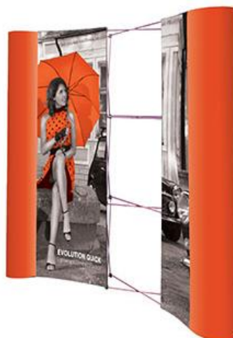
Traditional Straight and Curved Pop ups